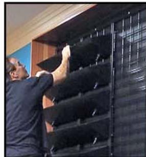
Self-Watering Fiberglass ASI Quality Trays w/ Grid Clips.