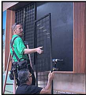
Multi-Purpose Steel Grid Panels Installs Easily.