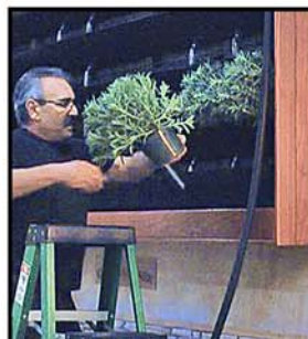
Simply place 6" Wicked Standard Nursery Pots into trays.